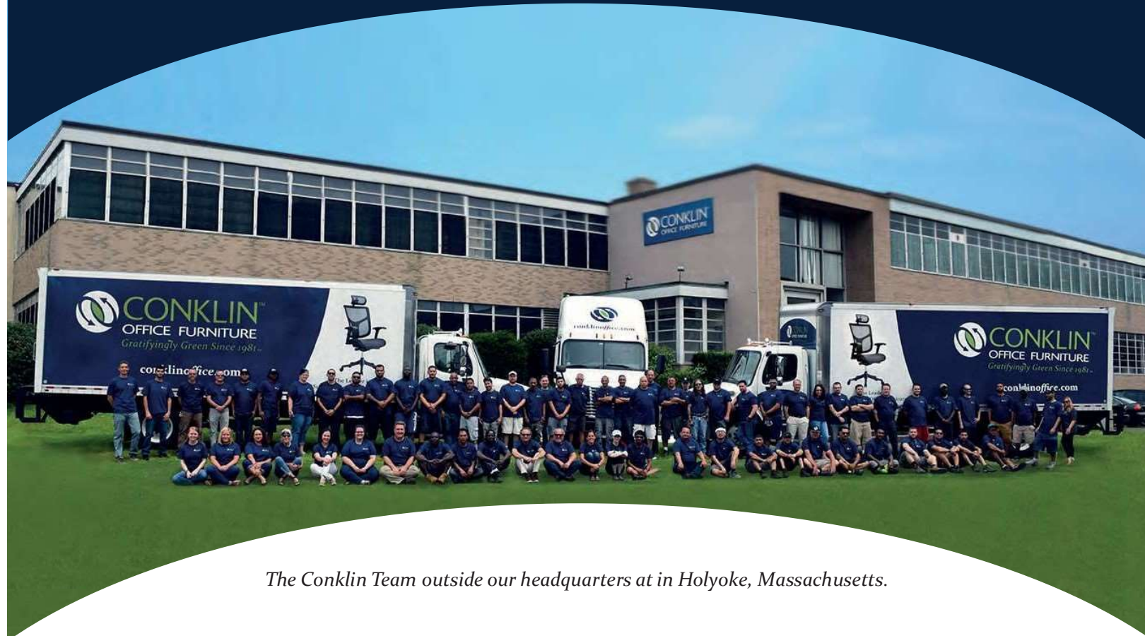
The Conklin Team outside our headquarters at in Holyoke, Massachusetts.